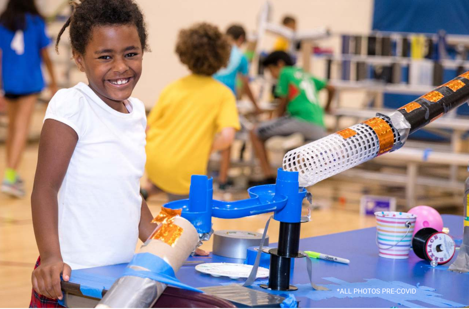
*ALL PHOTOS PRE-COVID